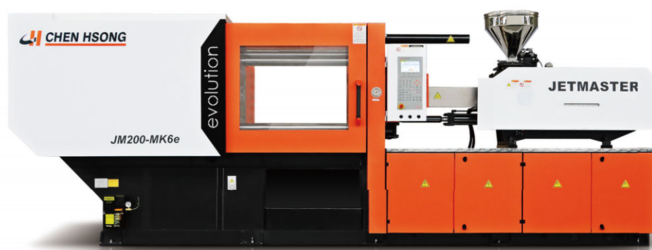
捷霸MK6e伺服驅動注塑機 JETMASTER MK6e Servo Drive Injection Moulding Machine

The Group's performance during the first half of this financial year was lackluster, with total turnover declining by 12% as compared with the same period of last year. Nevertheless, the Group's new product lines (especially the brand-new MK6e “evolution” series of injection moulding machines) have completed full market launch and were starting to garner rapidly growing sales volumes. Consequently, the Group registered strong sales growth in Q3 of this financial year (i.e. end of calendar year 2019 before the outbreak of COVID-19) which alone made up for most of the decline during the first half of this financial year. Although the Group was anticipating an equally-strong Q4 to round up an annual result with positive growth, the coronavirus outbreak and eventual global lockdown threw a serious wrench into this plan. In the end, the Group recovered part of the decline of the first-half and ended this financial year with a small turnover drop. Also, further to the Company's announcement on 31 January 2020 regarding the possible cooperation on the land plot located at Pingshan New District, Shenzhen, the Group is still awaiting feedback and response from the relevant government authorities.