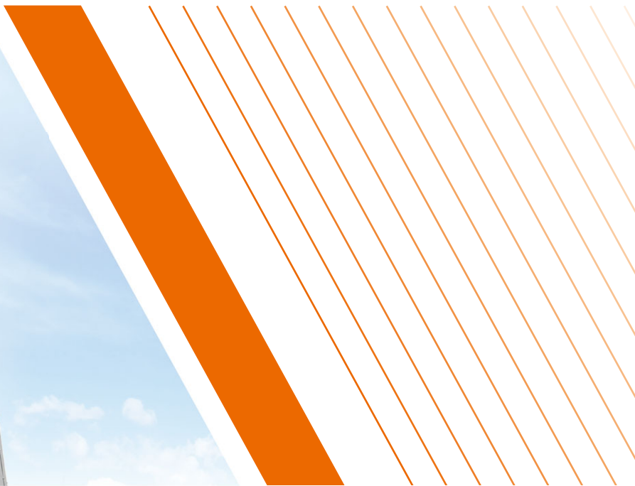
SPARK「星火」系列全電動注塑機 SPARK series of All-Electric Injection Moulding Machine