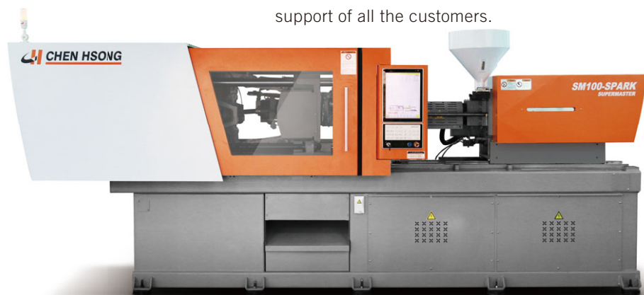
SPARK「星火」系列全電動注塑機 SPARK Series of All-Electric Injection Moulding Machine

Even with significant demand coming from the medical sector, however, traditional industries (such as automotive, electric appliances, electronic consumer products etc.) were in virtual standstill until mid-March when most companies were approved to restart production, while customers in Hubei province had to wait till April. This situation took a heavy toll on the Group's China market turnover during the months of February and March. When faced with such adverse market conditions, it was time for the Group's frontline teams to shine, the technical teams to reassert their strong backing, and the service teams to out-do what their duties called for. In an ultra-sensitive environment just out of the coronavirus scare, the Group's business teams diligently visited customers and partners to understand their needs and how they could help smoothen their production restart process. The end result was encouraging – the Group's annual China turnover only declined slightly by 2% to HK$1,039 million (2019: HK$1,062 million). Compared with the 13% drop during the first half year of this financial year, the Group was not able to achieve this good result in the second half year without the support of all the customers.